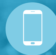
PDA's and Mobile Phones