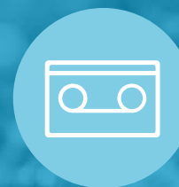
Back-up Tapes (DAT/DLT)