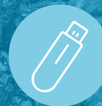
Memory Sticks/ Pen Drives/ Flash Media