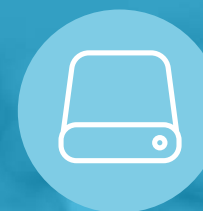
External Hard Drives