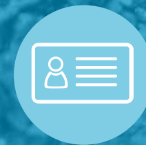
ID Badges, Electronic Tokens, PIN Readers