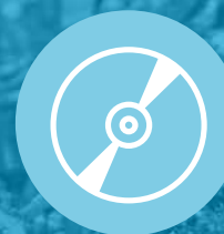
CDs and DVDs